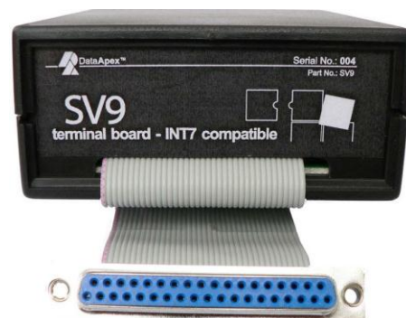
Closed Terminal Board with INT7 compatible connector

The SV9 Terminal board with easily accessible screw contacts and LED status indication is very suitable for users who will need to change the configuration of their instrument connections often or plan to use the additional digital inputs and outputs for instrument control, for example to use the digital output lines for controlling gradient, fraction collector, detector program start, detector autozero or valves switching.